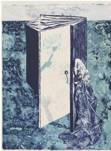
DOROTHEA TANNING The seven spectral perils €25,000-35,000