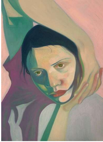
Inès Longevial, Cream cheese , 2021 oil on linen, 73x50 cm © courtesy of the artist and Ketabi Projects

Finally, Christie's will give carte blanche to INES LONGEVIAL (born in 1990) who will occupy an exhibition space in parallel with the presale exhibition. Inès Longevial executes drawings and paintings in resonance with impressions, feelings, sensations from which she naturally extracts the palette. The artist approaches her memories in color and gives form to candid and absorbed faces. If, in the artist's work, faces often become the site of whimsical ornamentation, finding their roots in a patchwork of bright colors through, this new series tends towards a greater simplicity and plays above all on chromatic variations. The silent attitude of this woman, declined in several ranges of colors and caught in a convoluted set of arms is inspired by several women artists such as Dorothea Tanning, Leonor Fini. The exhibition is created in collaboration with the Ketabi Projects gallery.